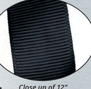
Close up of 12" grosgrain ribbon